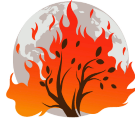
The Burning Bush Ex 3:1-12

This year we will be engaging in the Season of Creation as the theme for our worship gatherings in September. The Season of Creation is a time to renew our relationship with our Creator and all creation, through celebration and commitment together. During the Season of Creation, we join our sisters and brothers in the ecumenical family in prayer and action for our common home. The World Council of Churches was instrumental in developing and making this special time a season in the Christian calendar year that runs parallel to the Lectionary cycle of scripture readings. The season starts on September 1st, the Day of Prayer for Creation and ends on October 4th, the Feast of St. Francis of Assisi, the patron saint of ecology, beloved by many Christian denominations.